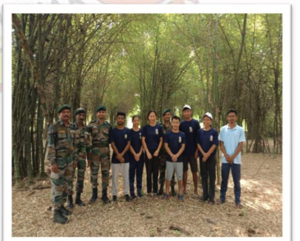
Fig- Glimpse of Cleanliness drive programme