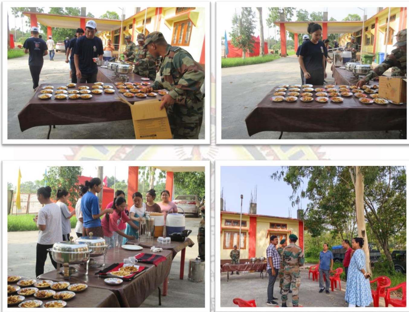
Fig- 135 ECO task force participated in distributing refreshment.