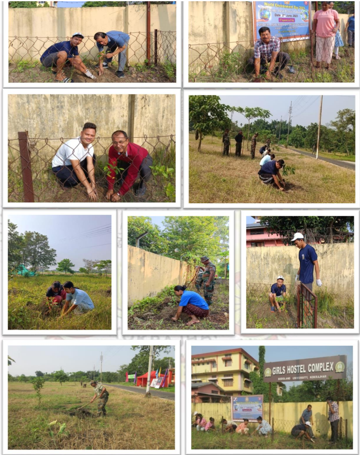
Fig- Glimpse of the plantation of saplings