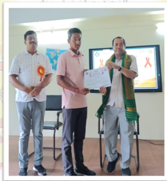
Figure; Glimpse of the Facilitation programme