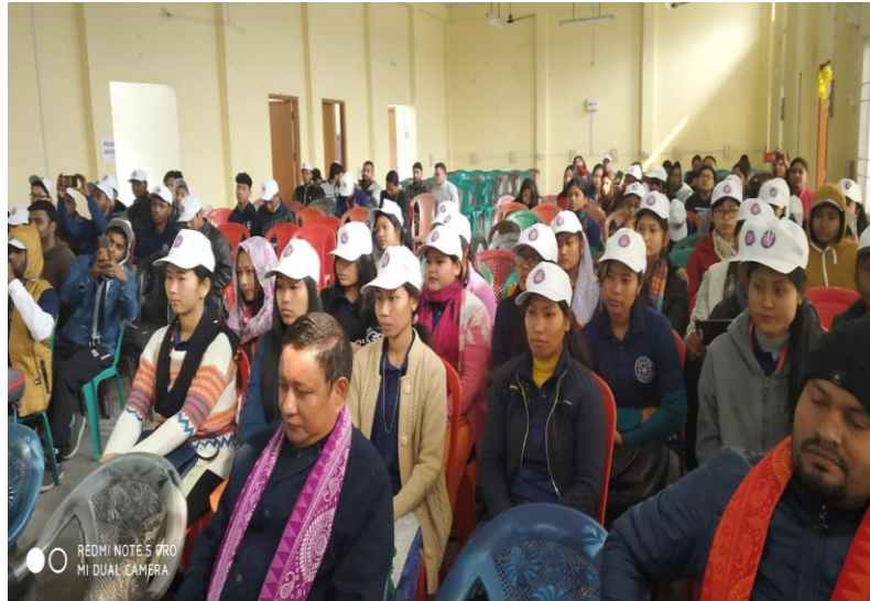
NSS volunteers participated in Lecture programme