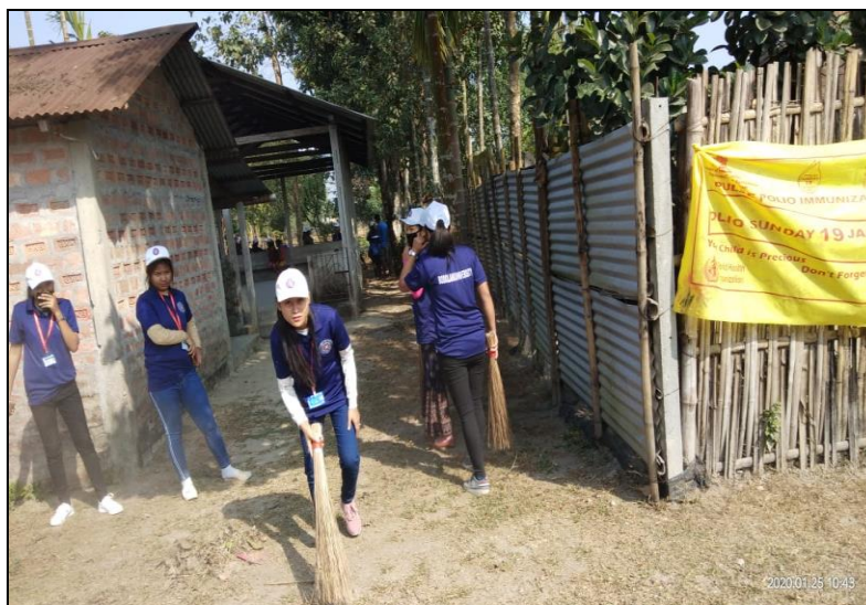
NSS volunteer participated in village cleanliness drive