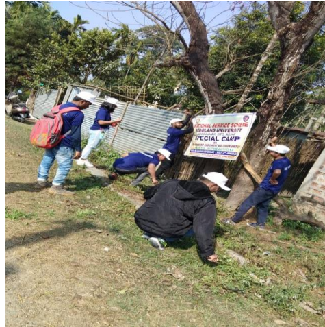
Cleanliness drive at New Deargaon village

2:00 PM-3:30 PM: Technical Session VIII: “Natural calamities & Role of NSS volunteers”Dr.Sibani Basumatary