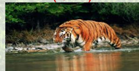
Manas National Park (105 km)