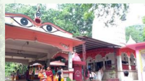
Maa Mahamaya Temple (45 km)